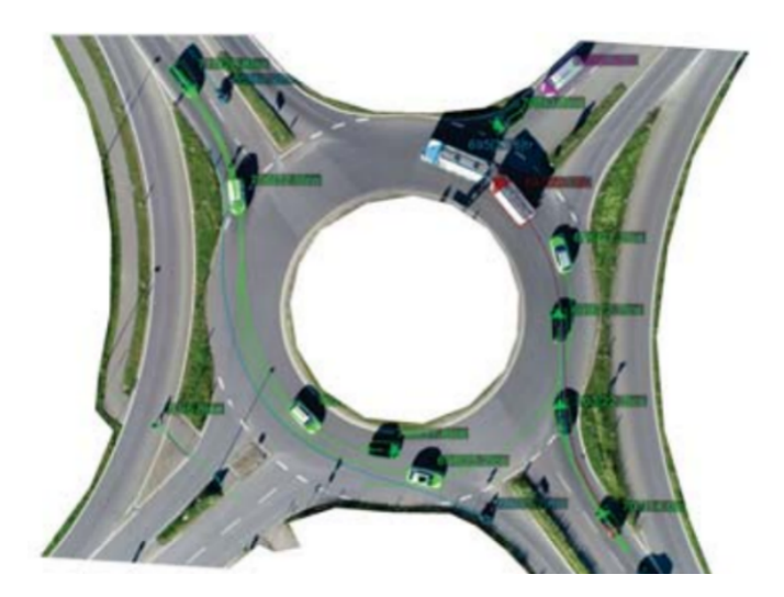
Figure 1: The RounD Dataset

The RounD (Roundabout Drone) dataset<sup>5</sup> (Krajewski et al., 2020) provides naturalistic trajectories of vehicles and vulnerable road users of selected German roundabouts. Each trajectory is recorded by drones with a error less than 10cm and includes vehicles (car, bus, trucks) as well as vulnerable road users (pedestrians, bicycles). The RounD dataset, as well as its related datasets (HighD,