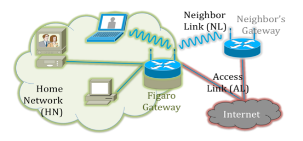
Figure 1: Monitoring vantage points.

The FIGARO network monitoring component has two main tasks: (i) to collect and to store monitoring data from various vantage points in the residential network, and (ii) provide an interface for other components of the FIGARO architecture to query this data. The supported vantage points are illustrated in Figure 1: Home Network (green, HN) usually Ethernet or WLAN; Home Network Gateway (blue, Gateway); Internet Access Link