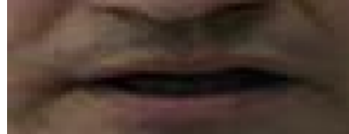
Figure 2: Example of an extracted mouth region

Having detected a frontal face in the image frame, as well as some facial features, we now extract a bounding rectangle of the detected mouth region and work on this new image. An example of an extracted mouth region is shown in figure 2.