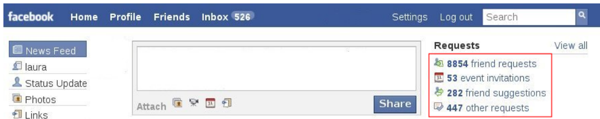
Figure 3: Screenshot of the test Facebook profile used for searching e-mail accounts: due to the suggestion feature, we have received thousands of friend requests.

friendship, LinkedIn aims to foster business collaborations. Hence, we can combine the business information about a user with the more personal, private information they may provide on the friendship site (e.g., under a nickname).