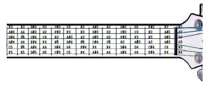
Fig. 1. Notes on a guitar fretboard

Mobile Communication Department Eurecom Institute Sophia Antipolis, France