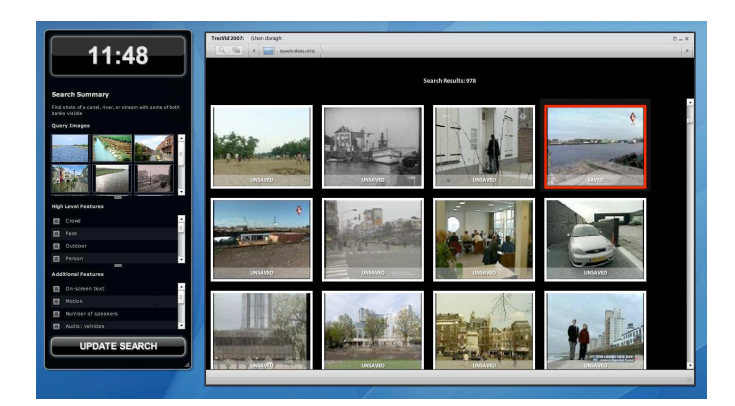
Figure 2: Shot-based user interface