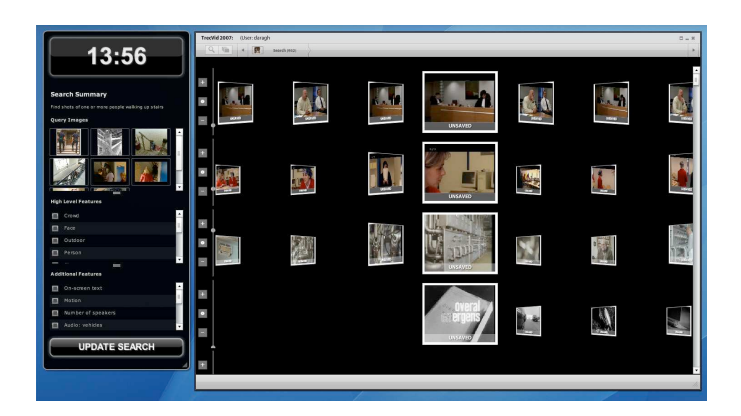
Figure 3: Broadcast-based user interface