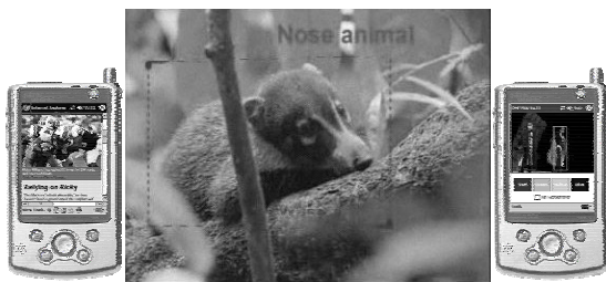
Fig 3: Illustration of different personalized user interactions from the same program

The extra content associated with an object is annotated with a version label, describing its nature. When the user selects an highlighted object, the personalization engine decides which version of the additional content is displayed. In the Documentary scenario, the moving objects are animals, and the associated content consists in either detailed explanations on their living habits for adults and a quiz game (MHP application) for children. Therefore, through their PDAs, several viewers may have different interactions with the same TV program.