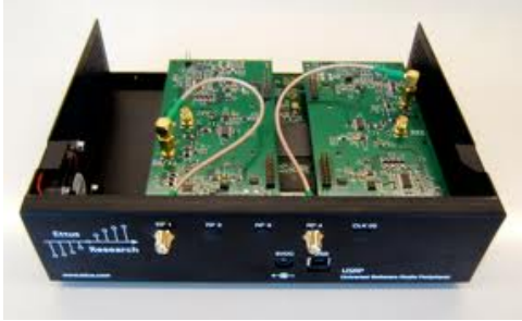
Figure 4. Ettus Research USRP1 kit.