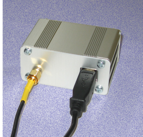
Figure 6. PlaneGadget ADS-B Virtual Radar.

1) Overview: As our main software base, we are using the GNURadio [48] open-software package. GNURadio is