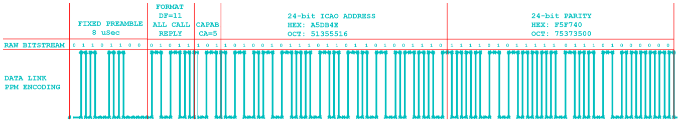
Figure 2. PPM-encoded ADS-B 56 bit sample frame.

probability of existence Mostly observed in intentional or unintentional prankster group, as shown in [47];