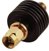
Figure 3. Attenuator VAT-10W2+.