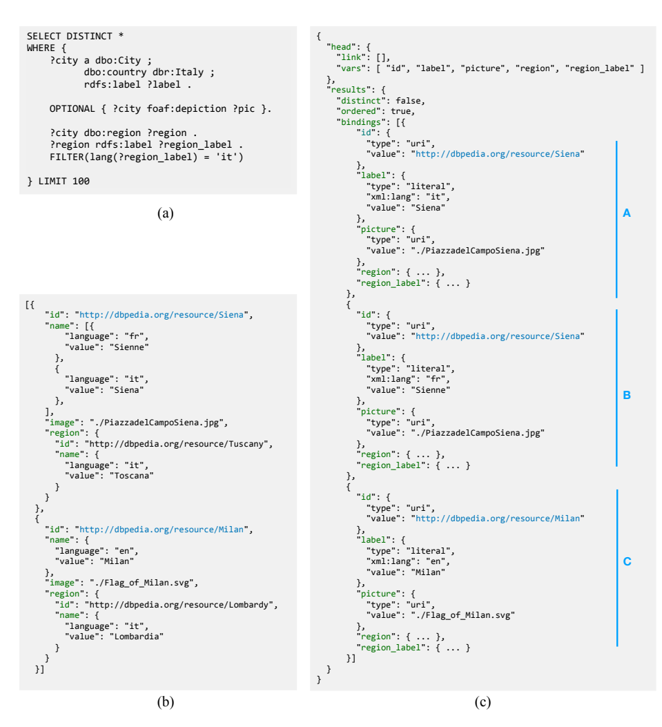
Fig. 1. A SPARQL query (a) extracting a list of Italian cities with picture, label and belonging region, of which the URI and the Italian name are also requested. In the standard output of the endpoint (c), the city of Sienna is represented by both object A and B, while the transformed output (b) offers a more compact structure.

Given this situation, we identify four tasks that developers have to fulfil: 1. Skip irrelevant metadata. A typical SPARQL output contains a lot of metadata that are often not useful for Web developers. This is the case of the head field, which contains the list of variables that one might find in the results. In practice, developers may ignore completely this part and check for the availability of a certain property directly in the JSON tree.