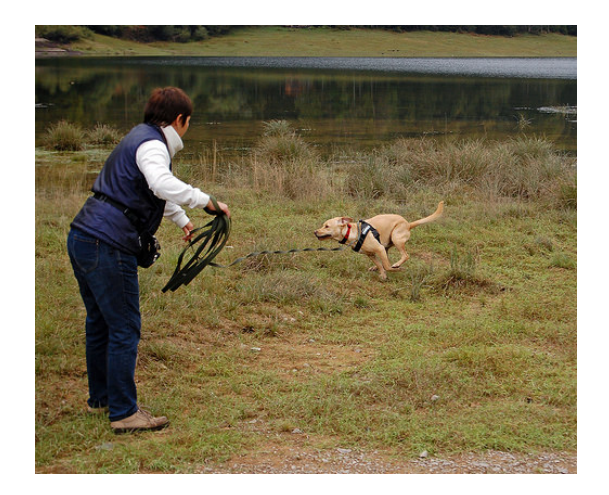
Figure 2: Image 117 was translated correctly as feminine "eine besitzerin steht still und ihr brauner hund rennt auf sie zu ." when not using the image features, but as masculine "ein besitzer …" when using them. The English text contains the word "her". The person in the image has short hair and is wearing pants.