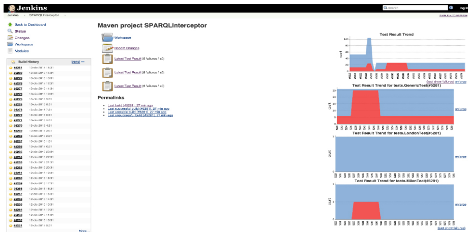
Fig. 2. Screenshot of SPARQL Interceptor: on the left hand side, we observe the build history; the center groups set of results of the run of the system; on the right hand side, the charts provide an overview of the different status of the runs.

that all entities are encompassed in a particular geographical coverage: in 3cixty, a city is delimited by a rectangular bounding box area and all entities of type dul:Place must be geolocalized within this bounding box. These queries are evaluated regularly, something that is done automatically by Jenkins, and summary reports are provided on the compliance of the outputs of these query evaluations with the expected results as described in the definition of the queries. Queries can then check both schema inconsistencies and data instances. The Figure 2 shows a snapshot of the SPARQL Interceptor in a real setting. Error logging follows the conventional presentation layout provided in