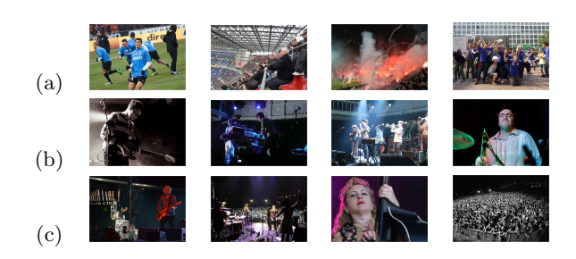
Figure 2: Example images of (a) soccer events, (b) concert events in Paradiso, Amsterdam, (c) concert events in Parc del Forum, Barcelona.

There are two differences between the two challenges. In the first challenge, both a topical (soccer) and a location criterion are defined for the events of interest, whereas in the second only a location criterion is defined (although the type of events that is held in these venues is easy to discover). Additionally, the specificity of the location of interest is different in the two challenges. These differences were deliberately opted for, in order to examine how the solutions of the participants would be affected.