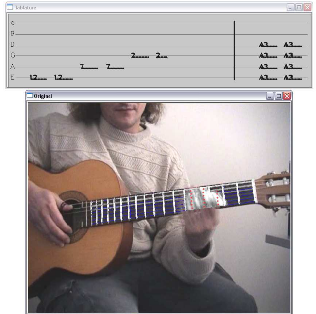
Fig. 2. Interface of the Automatic Transcription System

The process for obtaining the position of the frets is the following. The Hough transform is employed to find the orientation of the fret board, while the edges are obtained thanks to the Canny algorithm on the original image. The image is then rotated according to the dominant edge orientation in order to align the fret board with the horizontal axis. Wavelet analysis upon the rotated image is performed for enhancing the frets. Then, horizontal projection is performed in order to crop the image to the fretboard only. At this point we have