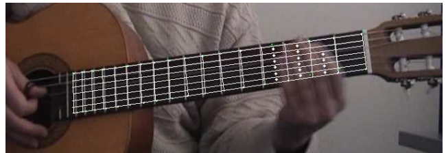
(a) Correct Tracking

The guitar tracking algorithm worked correctly all along all the videos. Nevertheless, issues may arise when dealing with fast hand movement which may significantly reduce the number of trackable points and/or slide a consistent number of tracked points in a specific direction. In these cases the two constraints that were described in section 2.2 may not be sufficient to perform a good tracking.