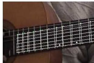
(b) Vertical adrift